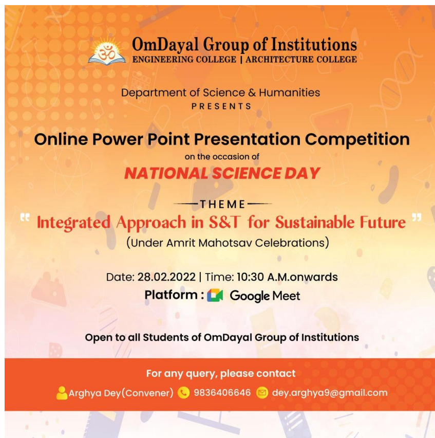
Poster of Online PPT Competition

An online Power Point Presentation Competition was organized by Department of Science & Humanities of OmDayal Group of Institutions on the occasion of National Science Day 28.02.2022. By celebrating this day as National Science Day, we paid our dignity and respect to the famous Indian Physicist Sir C.V.Raman for his contribution in the field of Science. The main theme was The Integrated approach in Science and Technology and the objective of this program was to ignite interest in science, inspire all people, especially students, to think new experiments, and make them aware of the latest developments in science and technology. The Vice Principal, Head of The Departments and the faculty members OmDayal Group of Institutions joined the program. At the very beginning of the program students were introduced to "Ek Bharat Srestha Bharat (EBSB)".